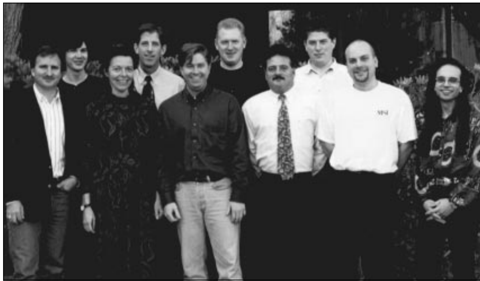
The staff of Metalithic Systems.

Pro Sound News , EQ , Electronic Musician and Mix . MSI left the convention with commitments for tens of thousands of systems. Digital Wings will be distributed through retail stores later this spring.