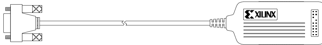
IBM PC or compatibles or IBM RS6000 workstations