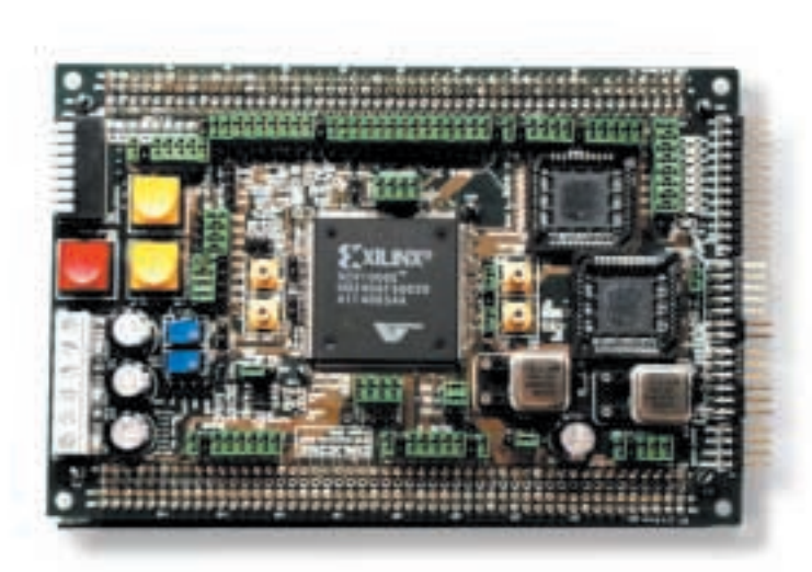
Figure 2 - Top view of the development board module

Push buttons, DIP switches, and LEDs form a user interface that allows you to provide configuration data and monitor display status information from the running system.