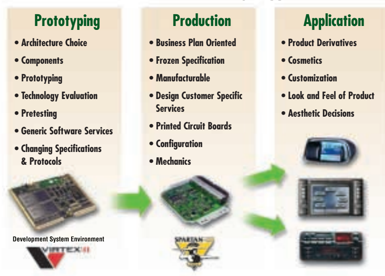
Figure 2 - Automotive multimedia platform design approach

(PCB) enables the design to be optimized and fitted into a smaller, low cost FPGA, such as a device from the Xilinx Spartan®-IIE family, while still leaving room for future system upgradability. Once in production, the FPGA can be used to aid total PCB testing using JTAG techniques. If necessary, designs can be ‘tweaked’ or enhanced at this stage.