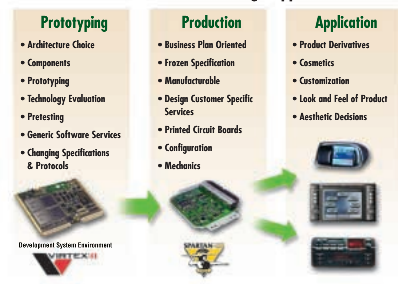
Figure 2 - Automotive multimedia platform design approach

(PCB) enables the design to be optimized and fitted into a smaller, low cost FPGA, such as a device from the Xilinx Spartan<sup>®</sup>-IIE family, while still leaving room for future system upgradability. Once in production, the FPGA can be used to aid total PCB testing using JTAG techniques. If necessary, designs can be 'tweaked' or enhanced at this stage.