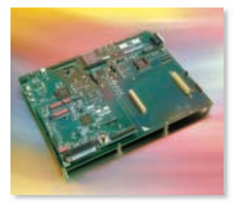
Engineering Support Platform motherboard

sion cards for multiple solutions, or you can build a total solution in a modular environment. The days of purchasing a development board for a single application are gone.