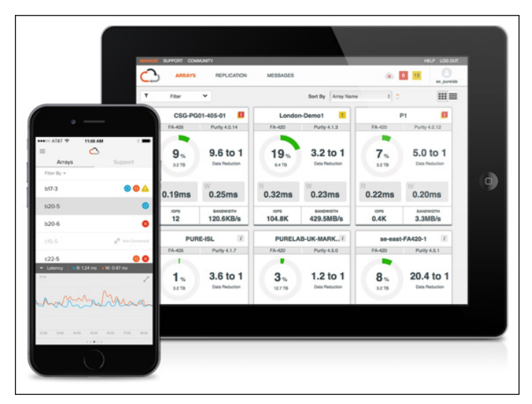
Figure 5-1: Pure Storage Pure1 administrative interface provides real-time at-a-glance details.

that matter, such as current storage capacity, level of experience data reduction, read and write latency, and throughput. You shouldn't need to go digging for these important details. Figure 5-1 provides an example of an administrative interface that gets the job done from any device. Information at your fingertips aids data-driven decision making around the need to scale very easy.