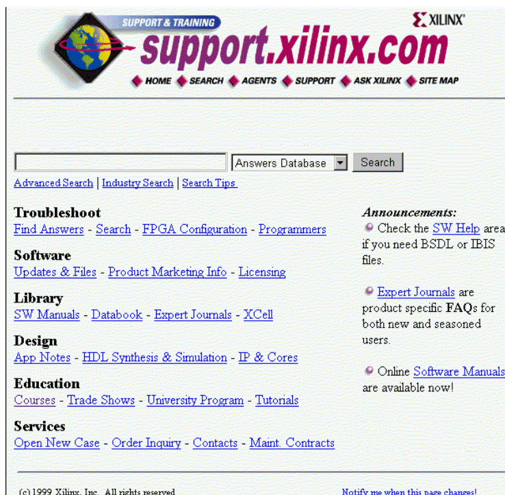
Figure 1: http://support.xilinx.com — For the Designing Engineer