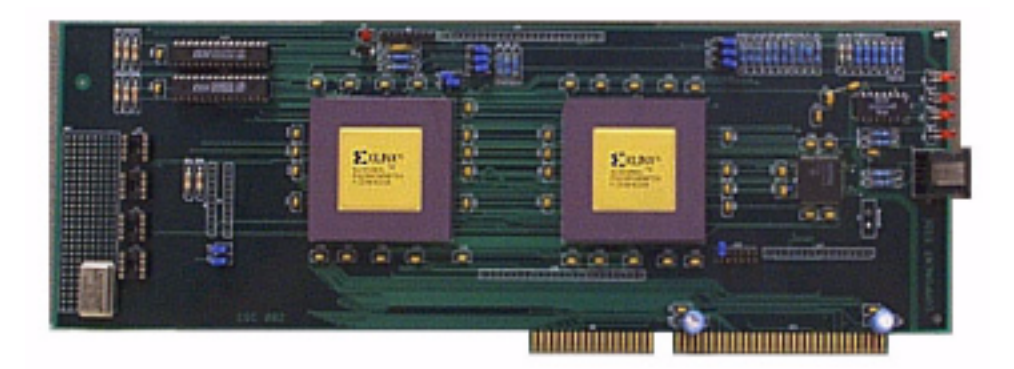
Figure 1: 10/1000 Ethernet NIC Board

Data from the PHY device is accepted by the MAC receiver. The Rx Controller takes this data from the MAC and stores it in the memory. At the end of a successful packet reception, a bit in the Rx status register is set for generating an interrupt to the host. The host then reads the packet data from the memory through the Host controller.